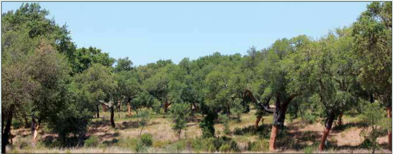
Serra de Grândola, Alentejo, Southern Portugal

to involve yet others that are seeking to mitigate their carbon footprint. This could contribute to the further promotion of good management practices in cork oak “hotspot areas for carbon and biodiversity conservation” in the region of the Tagus and Sado watersheds or similar regions elsewhere.