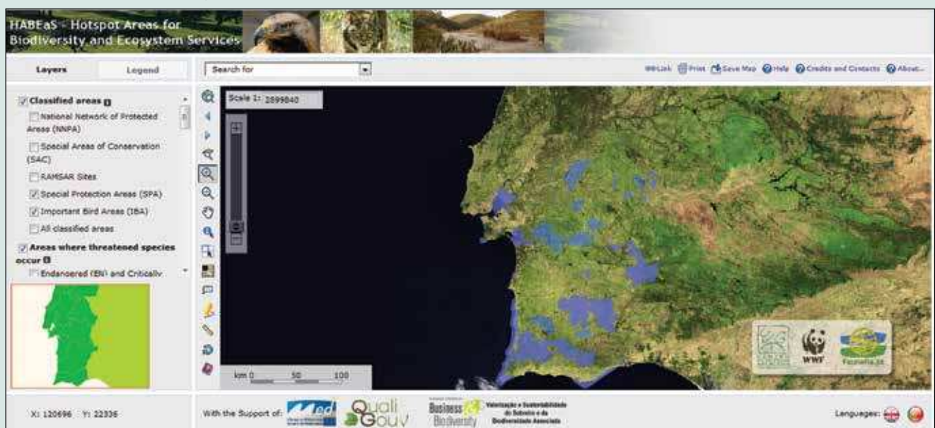
2 Printscreen of HABEaS WebGIS showing (in blue) areas of interest for the protection of birds in southwestern Portugal

The impacts of the GHoC project have been positive, both for the ecosystem service providers and for potential buyers. Indeed, the project is helping to increase the awareness of cork oak landholders about the importance of sustainable management practices and certification for the conservation of the cork oak landscape, the products it generates and the biodiversity it harbours. Concerning potential donors and ecosystem service buyers, other companies have been contacted and are also becoming engaged in the project. There is untapped potential